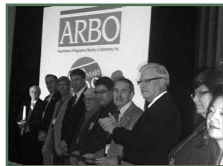
Presentation of 2008-2009 and 2009-2010 ARBO Board