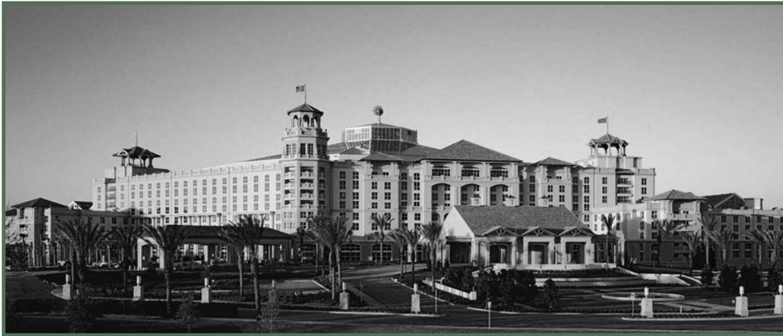
Gaylord Palms Hotel and Convention Center in Orlando - Kissimmee, Florida will be the site of ARBO's 91st Annual Meeting.

Mark Your Calendars for June 13-15, 2010!