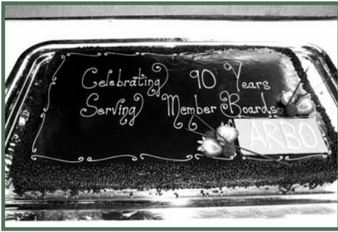
ARBO celebrated 90 years serving Member Boards at the 2009 Annual Meeting