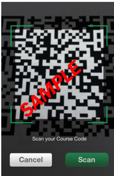
An example of a QR code that is scanned for the COPE course you are attending, giving you instant credit in OE TRACKER .