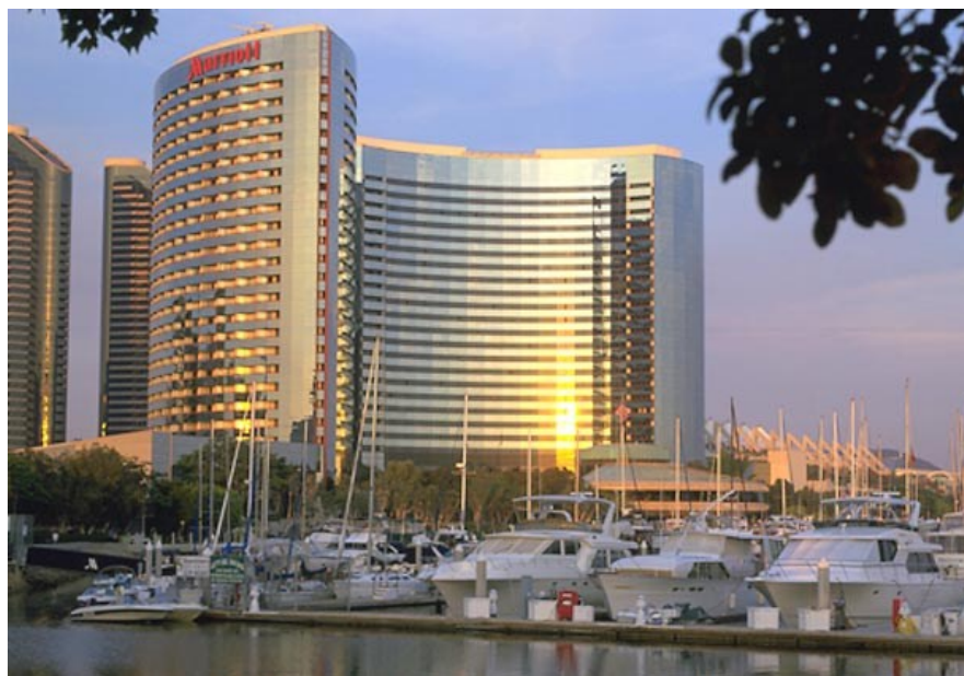
San Diego Marriott Marquis & Marina, San Diego, California