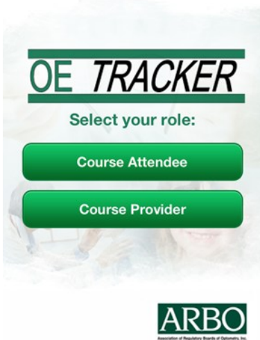
The app's Home Screen, which allows you to choose your role when you log in— a course provider or a course attendee.

ARBO has created a new smartphone app specifically for OE TRACKER ! The app is available for iPhone and Android users and can be used to track attendance of COPE-Accredited courses. Optometrists attending CE no longer have to worry about faxing attendance certificates or waiting for the CE provider to send the attendance to OE TRACKER . Simply download the free OE TRACKER app and log in using your OE TRACKER username and password. Then, simply scan the QR code that is provided by the course provider. Attendance of the course will instantaneously be sent to OE TRACKER and you will be sent an e-mail verifying your attendance.